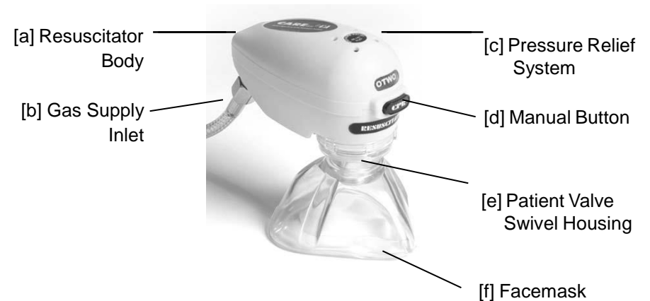
Disassembly of the resuscitator (fig 3.)

All other components should be wiped clean with a mild soap solution. Under no circumstances should the complete unit be allowed to be soaked or immersed in cleaning solutions.