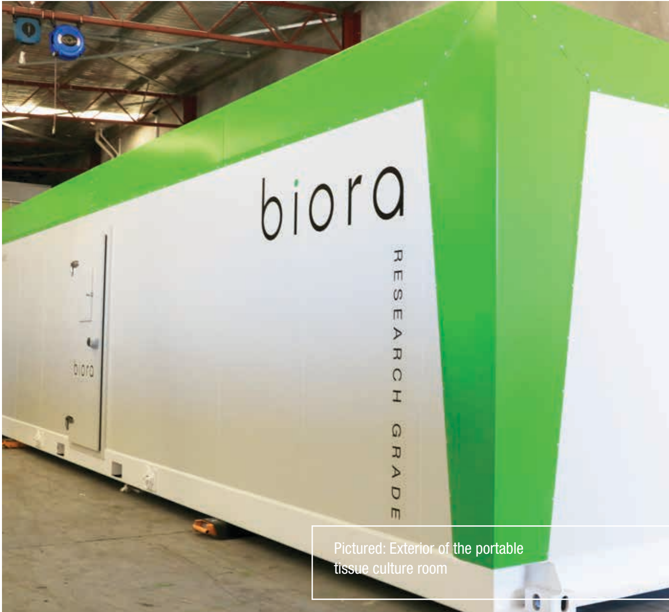
Pictured: Exterior of the portable tissue culture room

New developments in technology, together with local expertise, assisted the Australian University in the expansion of their current research into plant propagation. The research body was able to commission a custom plant tissue culture chamber to reflect the conditions of the current lab. As a result, researchers continue to make headway in the advancement of farming techniques.