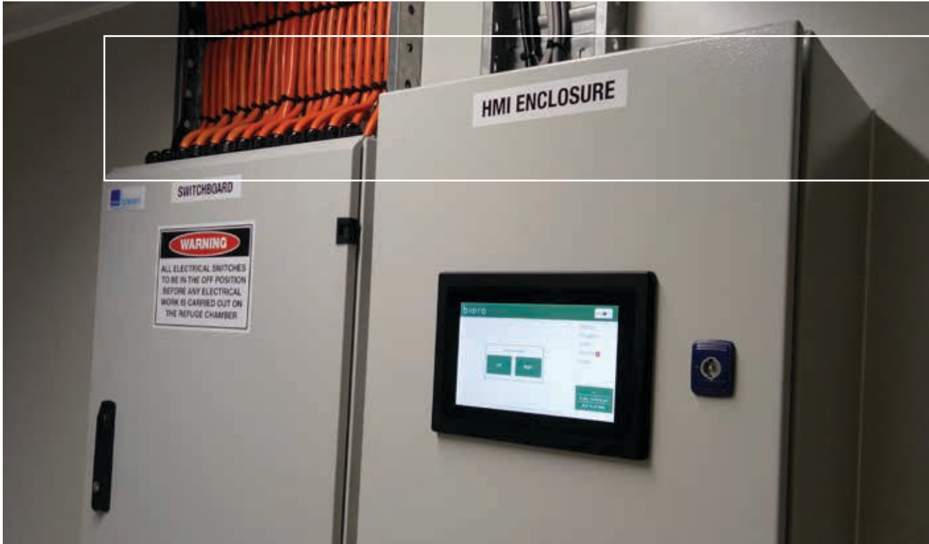
Pictured: HMI control panel within the airlock

Technology is changing the way research is conducted, and one primary influencer has been remote monitoring. Accessing data from within a plant tissue culture room or laboratory without physically entering and checking the chamber provides more flexible, improve response times, and reduces unnecessary interruptions. Due to the nature of the testing, sustainability and replicability of specific growth environments were crucial to the University.