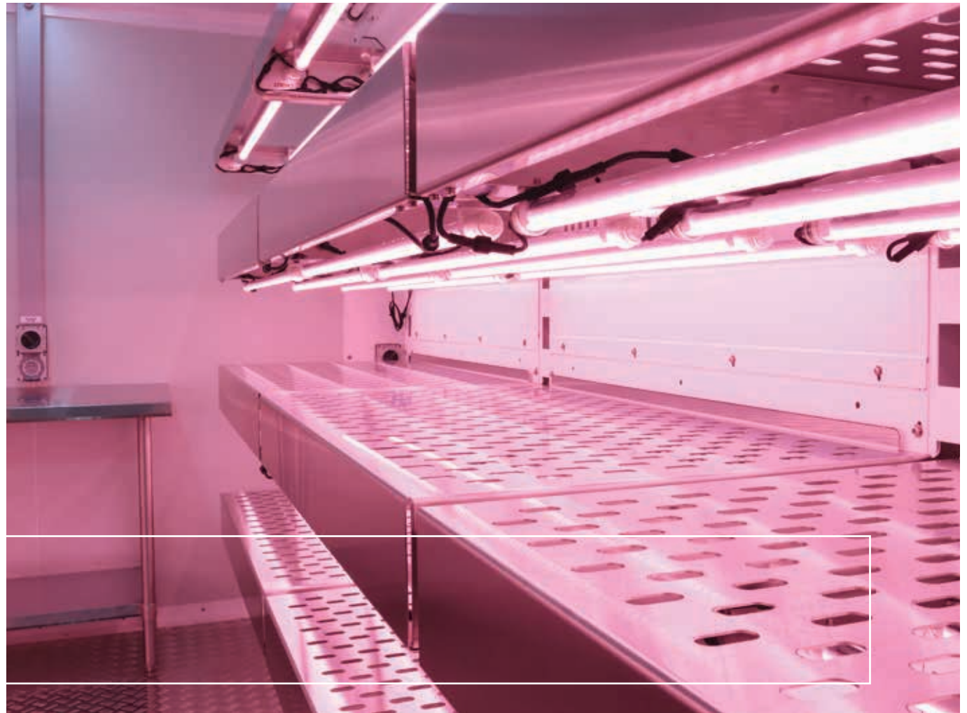
Pictured: Custom LED lighting

Further to this, the LED lights are IP 64 rated (water and impact resistance) and easy to clean, which helps QAAFI maintain the integrity of the chamber and prevent contamination.