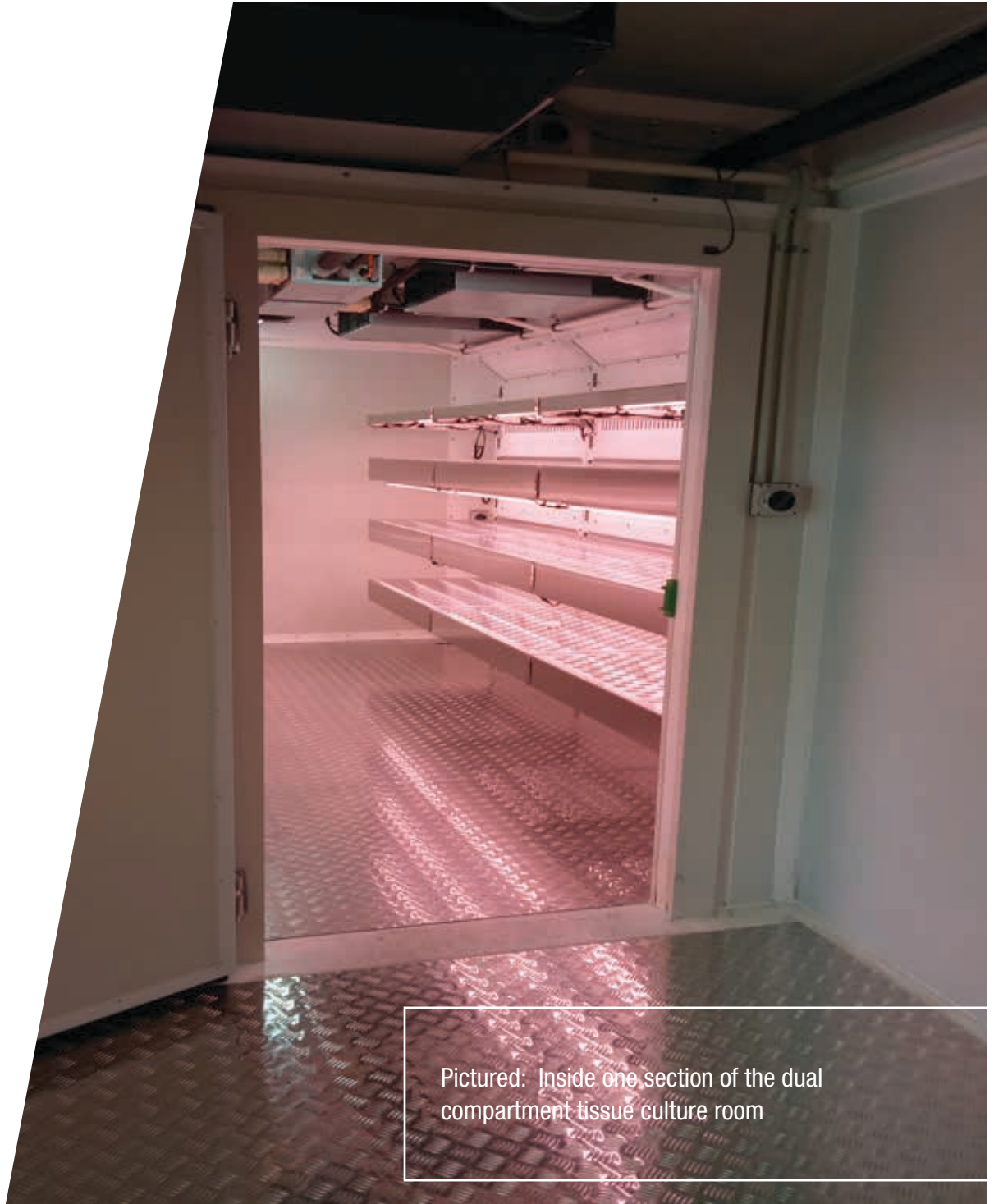
Pictured: Inside one section of the dual compartment tissue culture room